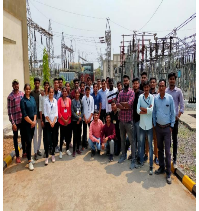
25 March, 2022 --6 th semester students visit