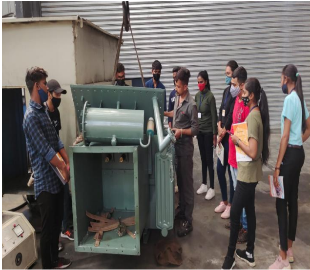
8 March, 2022. 27 Students were taken for Industrial Visit

The Electrical Engineering Department organized an industrial visit at Trans- Electro, Gundlav GIDC, Valsad for the VI semester students on 8th March and 25 th March 2022. The visit helped the students to gain knowledge of maintenance of transformer, different test on transformer and transformer oil. About 57 students visited the industry.