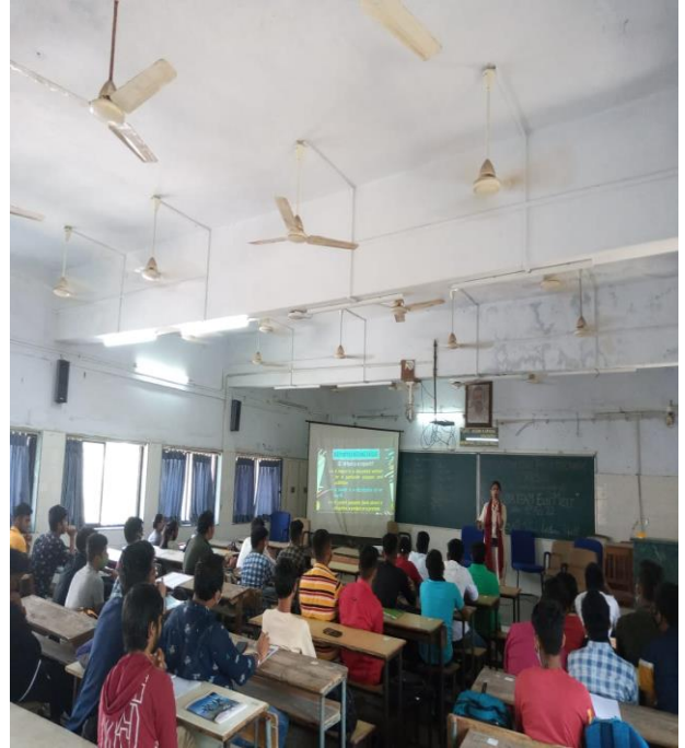
KCG- Empanelled Trainer – Harita Patel (Batch 2)