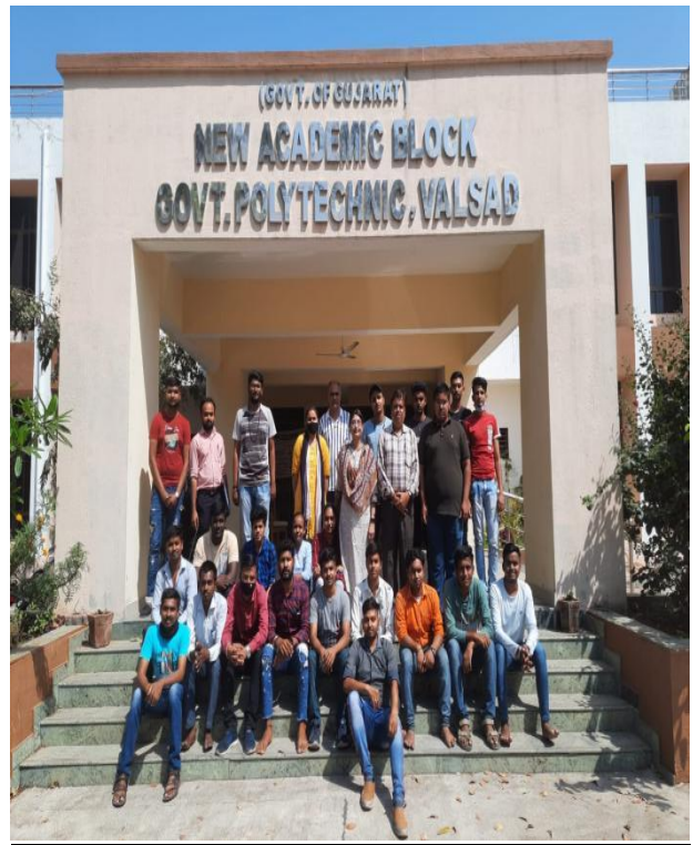
Last day of finishing School -Group Photos Batch 1 & 2