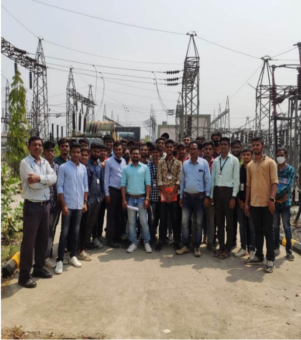
24 March, 2022 --4 th semester students visit

The Electrical Engineering Department organized an industrial visit at ATUL Substation 220 KV on 24 March for 4 th semester and on 25 March for 6 th semester students. The visit helped the students to gain knowledge about working of different equipment used in substation. About 60 students visited the industry.