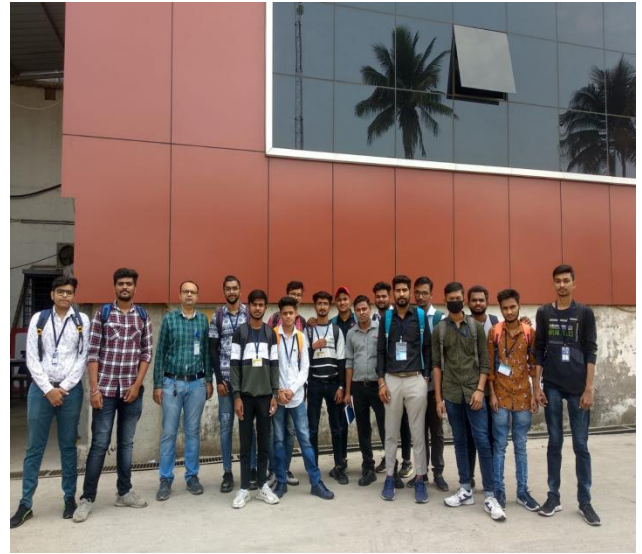
25 March, 2022. 31 Students were taken for Industrial Visit

The Chemical Engineering Department organized an industrial visit to Vasudara Dairy, Valsad District Cooperative Milk Producers' Union Limited, Navsari for the 4 th & 6 th semester students on 16 th & 17 th March, 2022.